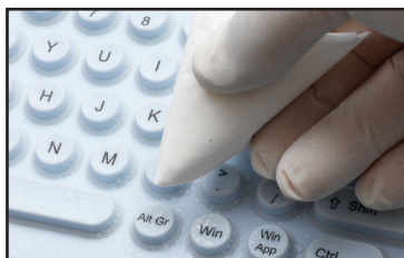
Easy to wipe down