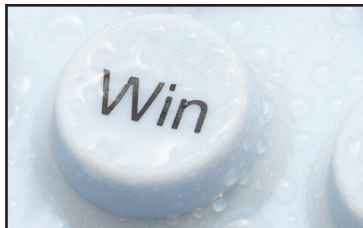
No infection traps